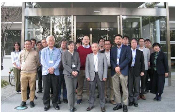
PF members at the Conference for the Migration of J-Node PFs (at RIKEN 2019.3.15)

Secretariat of the INCF Japan Node (J-Node) was launched in 2005 at RIKEN Brain Science Institute. This fiscal year, Center for Brain Science (CBS) was launched and thereby J-Node secretariat was passed onto CBS. However due to reconsideration of the CBS plan, closure of J-Node secretariat has been decided and accordingly, the collaborative development of neuroinformatics platforms and the support to the community activities will finish. We would like to thank all the PF members who collaborated with the neuroinformatics developments, researchers and the students who participated Hackathon and the conferences, and to many people who has worked with us in domestic and overseas institutions all these years. From now on, some of J-Node PFs and J-Node portal site will be operated safely at a static archive site, while others will be migrated to other sites and will be continuously be operated.